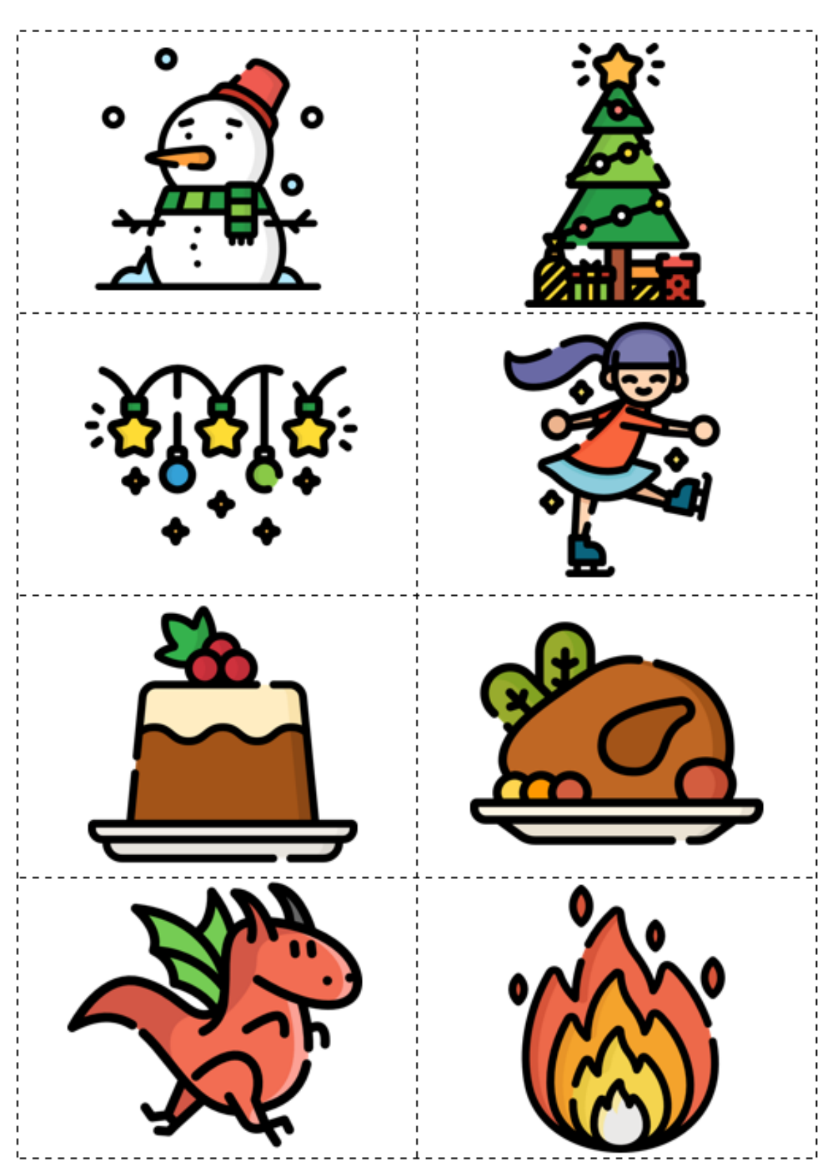
Icons made by freepik from www.flaticon.com